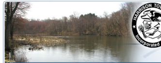
Mullica Hill Pond

We are also looking for more volunteers for our Boards and Commissions so if you want to get involved, or